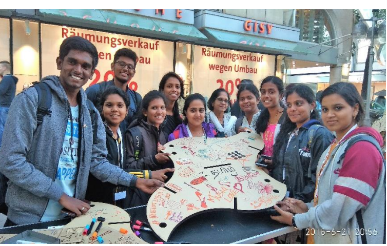
Students participating in the Art & music festival in Hannover