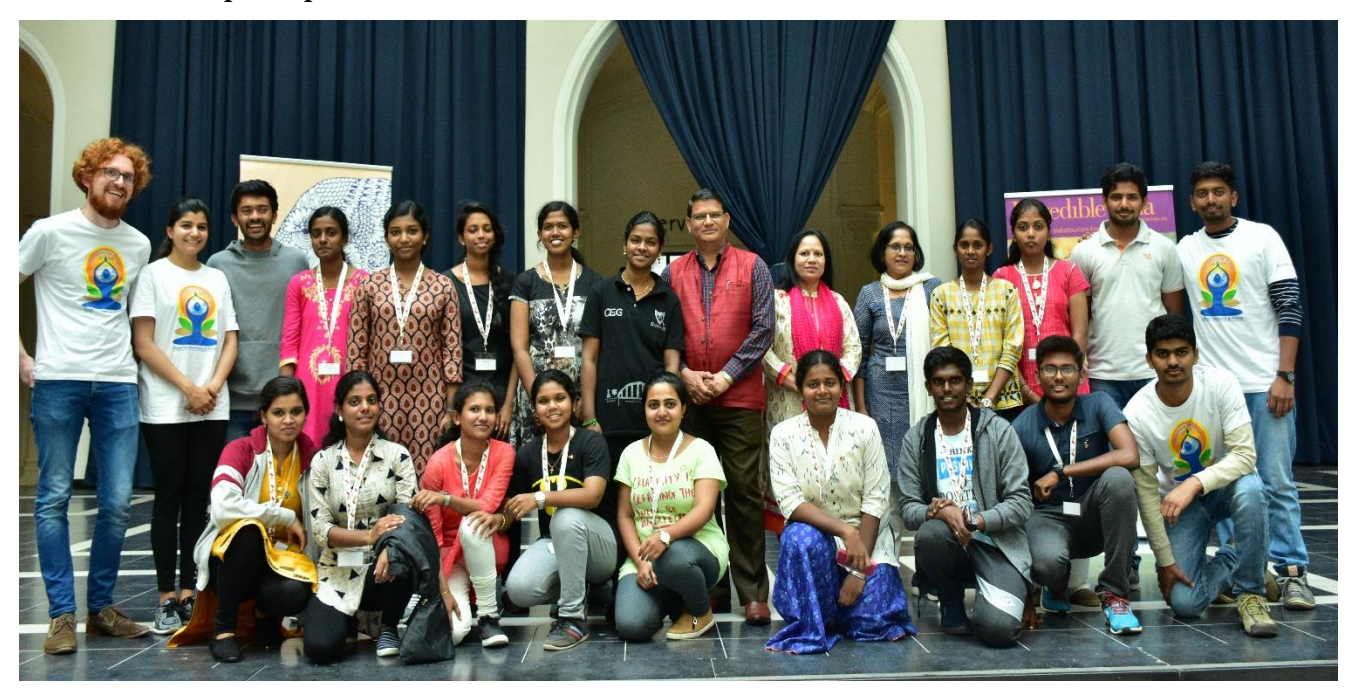
International Yoga Day presided by consulate general of Hamburg on 21st June

The details of participants and organising committee are attached in Annexure 1.1 and detailed agenda of the HTTP in Annexure 1.2.