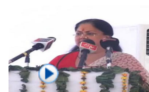
Raje pushes for...