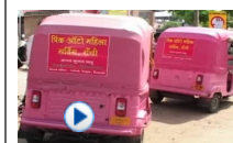
Pink autos a hi...