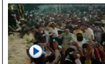
BJP MP showers ...