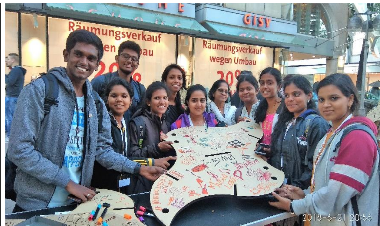
Students participating in the Art & music festival in Hannover