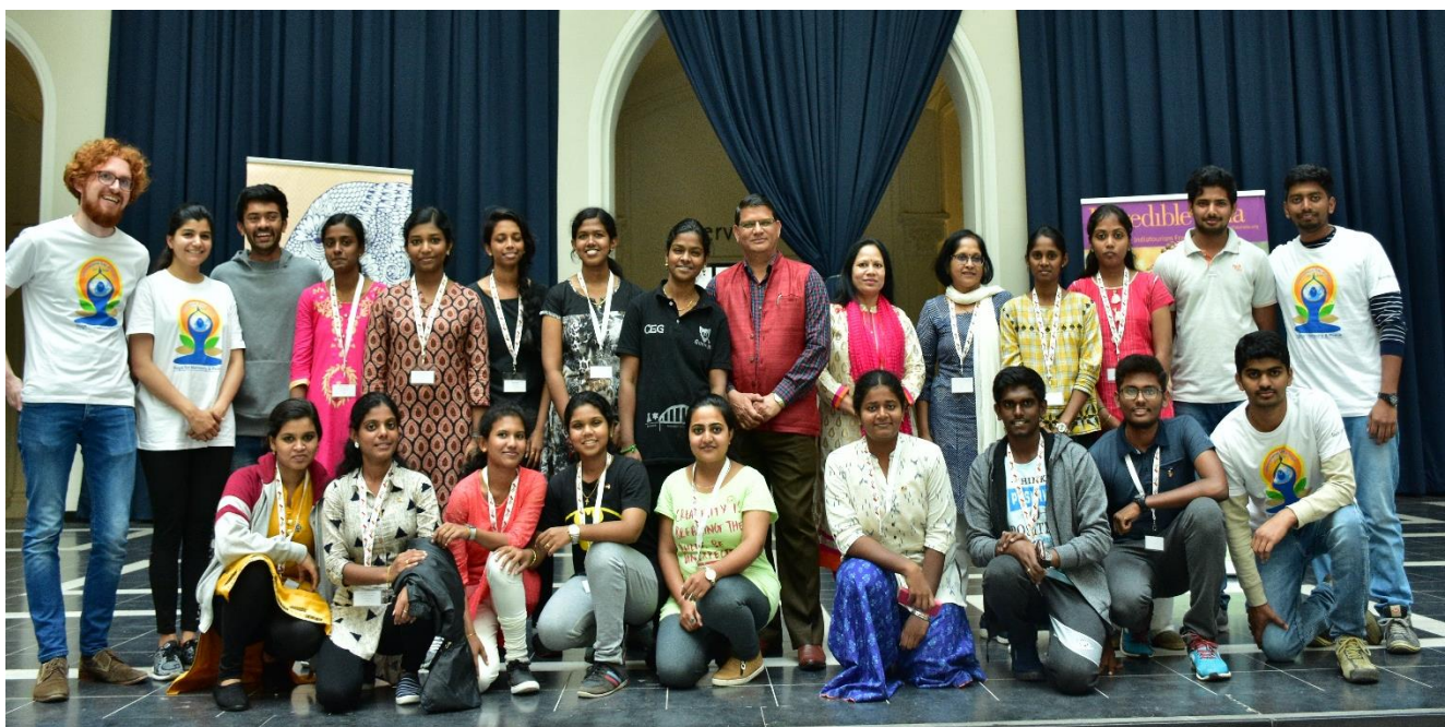
International Yoga Day presided by consulate general of Hamburg on 21 st June

The details of participants and organising committee are attached in Annexure 1.1 and detailed agenda of the HTTP in Annexure 1.2.