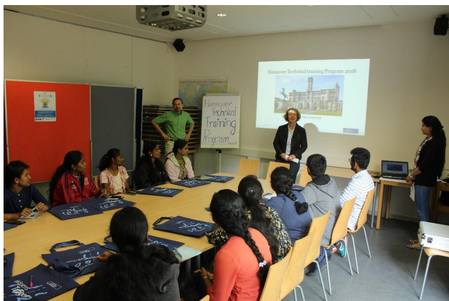
Opening Day of Hannover Technical Training Program

Institute of sanitary engineering & waste management (ISAH) & International office from Gottfried Wilhelm Leibniz Universität Hannover (LUH) jointly organised a two week Technical Training Program from 18th June - 2nd July, 2018. The program was organised for 14 students and 1 faculty member as part of Memorandum of Understanding (MOU) with Anna University, Chennai. Members of Indian association Hannover (IASH) actively supported the organisation of HTTP.